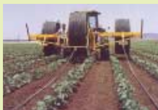
Dripperline Layout Unit