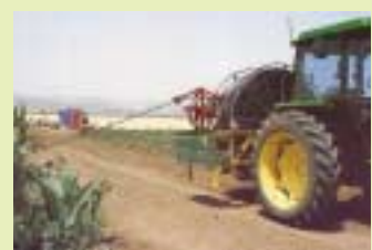
Retrieving Coiling Unit

*A wide range of additional application tools is also available