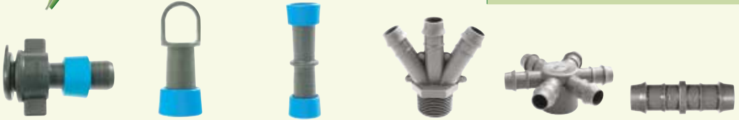
Full Range of Ring Connectors for Thin Wall Dripperlines 16, 22, 23, 25 and 35 mm