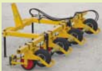
Dripperline Extracting and Lifting Unit